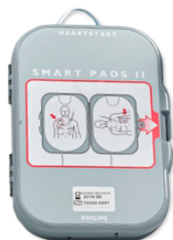
HEARTSTART SMART PADS II