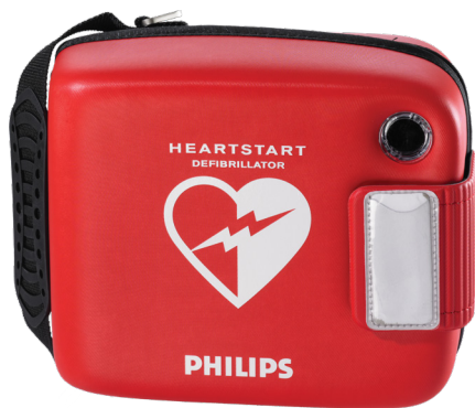
PROTECTIVE CARRY CASE